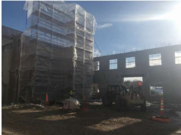
Interior View of New South Classroom Tower