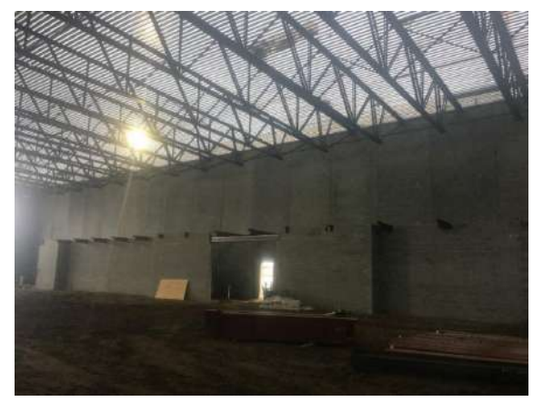
Existing Competition Gym Interior