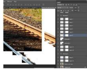
pasting selected part of image to extend