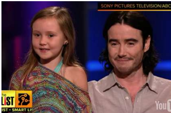
Video: Top Kid Inventors from ABC's Shark Tank