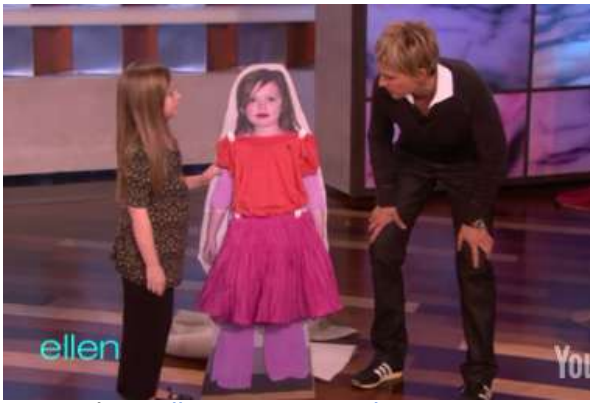
Video: Ellen - Great Kid Inventions!

List three problems that were solved with the innovations and inventions for each of the videos and article.