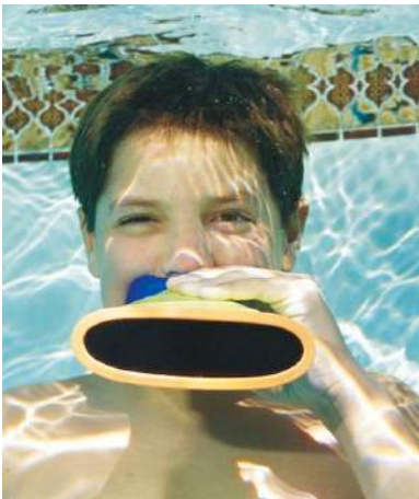
Article: 10 Great Inventions Dreamt Up by Children