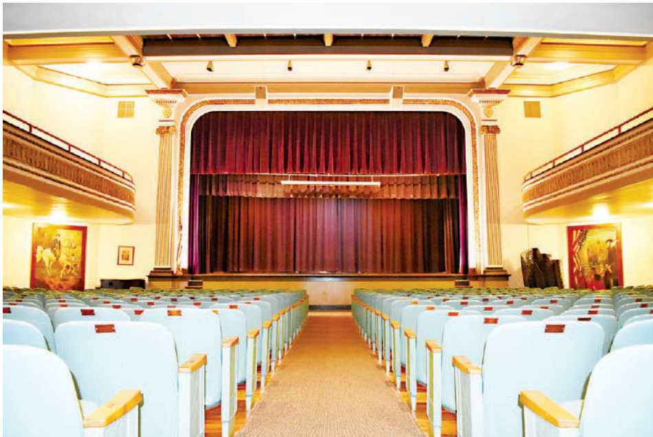
Ground level illuminated view of the Northumberland County Career and Arts Center auditorium.

View inside marble foyer looking toward the stairwell of the Northumberland County Career and Arts Center in Shamokin.