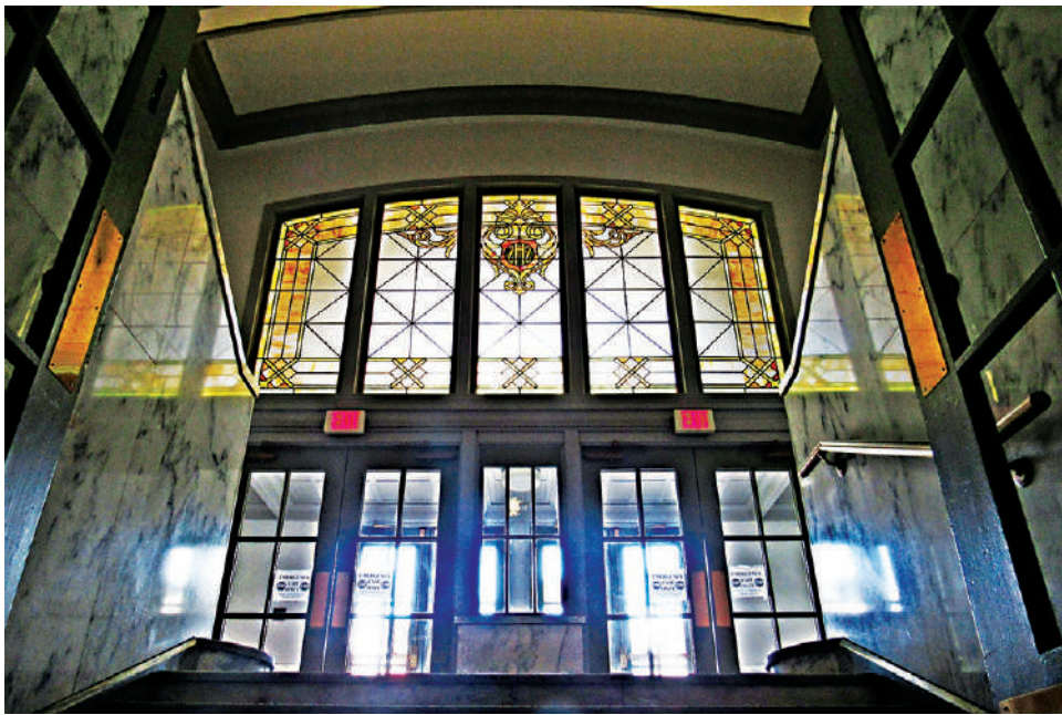
Sunlight from stained glass plates reflects upon the darkened marble slabs inside the grand foyer