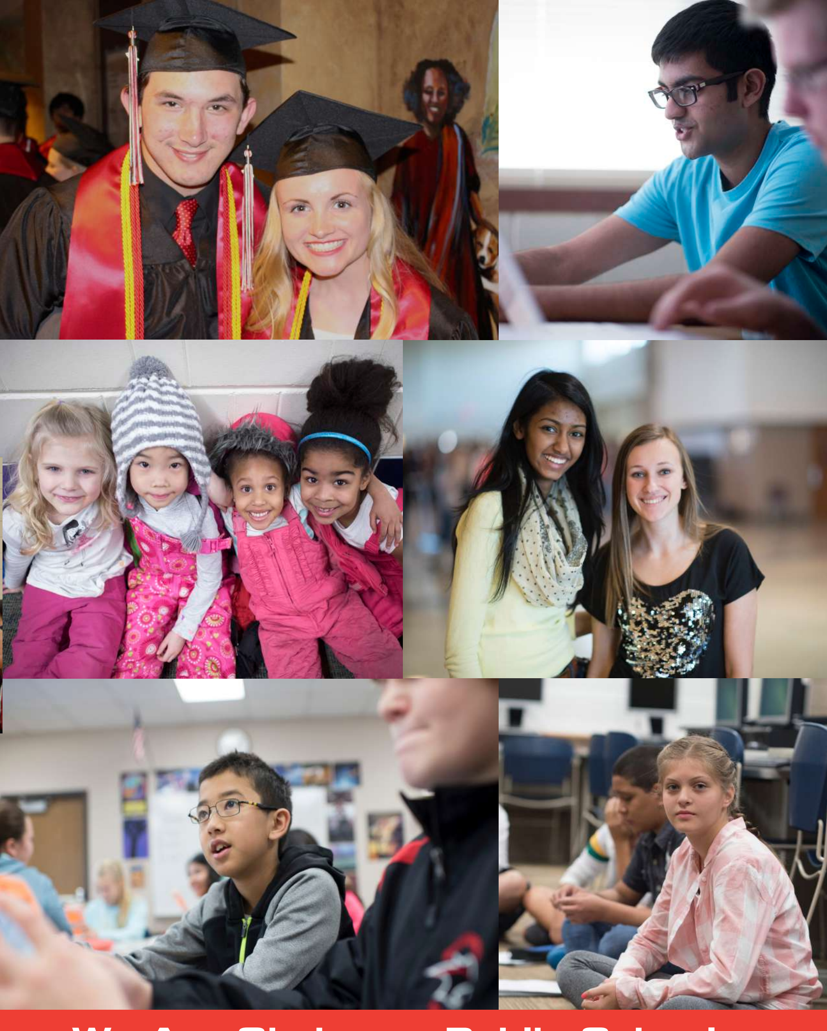
We Are Shakopee Public Schools.