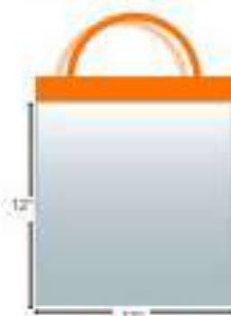
CLEAR TOTE 12"x6"x12" One bag per person