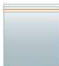
PLASTIC STORAGE BAG One gallon, re-sealable, clear One bag per person