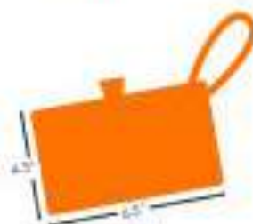
CLUTCH 4.5"x6.5" One bag per person