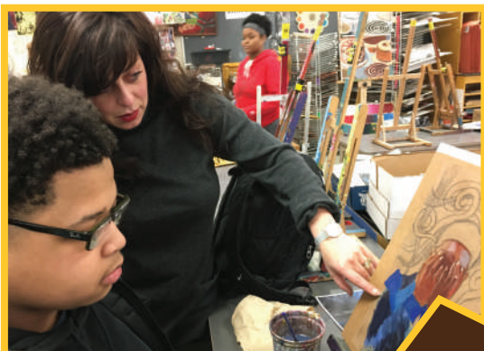
SEL Teachers are always willing to help our students grow!