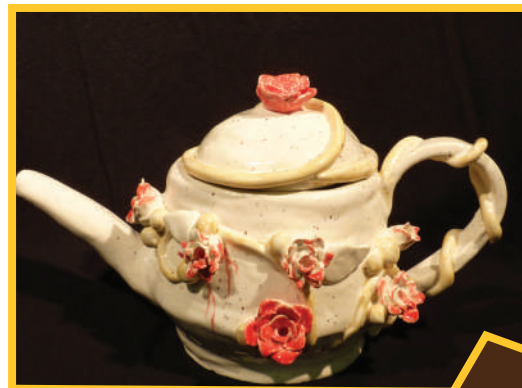
...from January 16 – February 2 at the Cleveland Institute of Art.