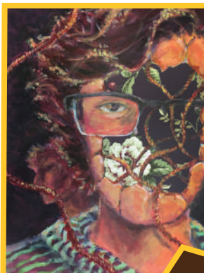
... for all of NE Ohio to see...