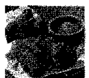
414 Oven Roasted Chicken Wings with BBQ Dry Rub Seasoning