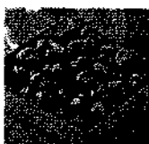
804 Whole Blueberries "All Natural"