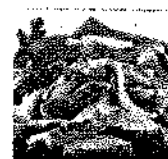
496 Fire Grilled Chicken Breast Strips