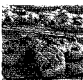
644 Chocolate Chip Frozen Cookie Dough