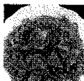
450 Chicken Lo Mein Skillet Meal