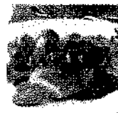
502 Unbreaded Chicken Breast

Call 1-855-870-7208 and provide Campaign ID: 34254 and Team Member ID, if applicable.