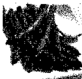
781 Asparagus Spears