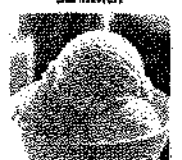
204 Vanilla Ice Cream