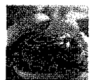
458 Black Angus Burgers