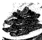
811 Fully Cooked Bacon Slices