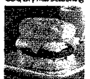
898 Sausage, Egg & Cheese Breakfast Sandwich