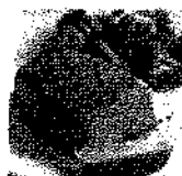
393 Boneless Pork Loin Chops