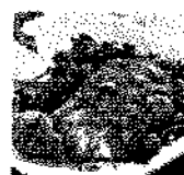
503 Ancient Grain Encrusted Cod