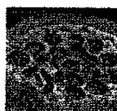
603 Pizzeria Perfection Pizza