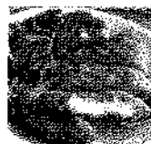
404 Oven Baked Chicken Breast