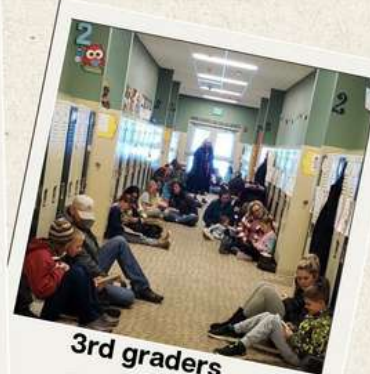
3rd graders and families