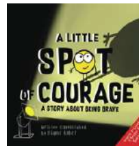
A Little Spot of Courage- Diane Alber