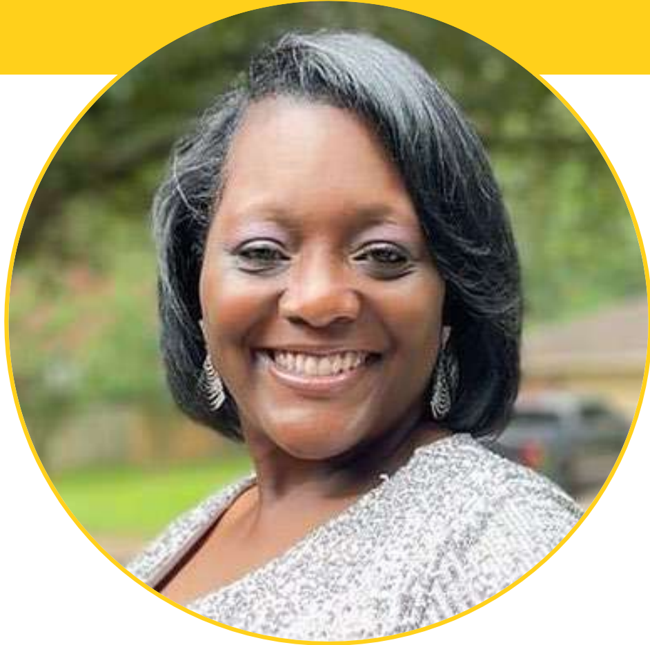
Yosantas Burton Lake Elementary