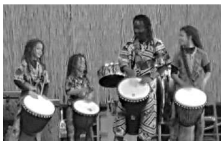
The Seisay family performed energetic and inspirational traditional drumming to give a perfect ending to Africa learning experience.