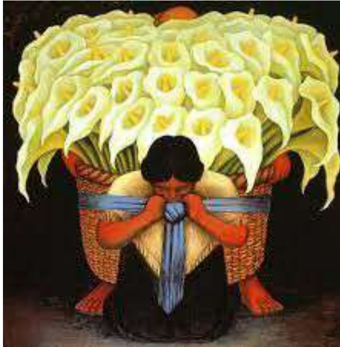
*Art by Diego Rivera

The following slides will share what some of the schools are doing to highlight Hispanic/Latine Heritage Month