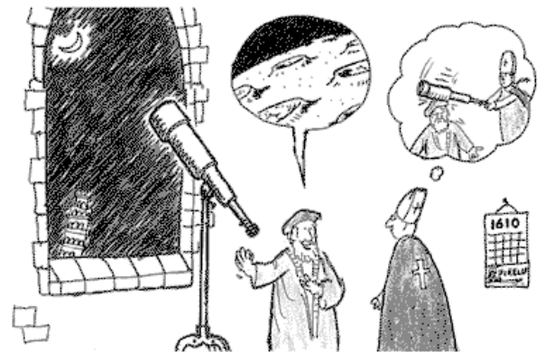
Galileo discusses his discoveries with the church.