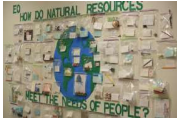
Kindergarten Pajama Project gives to others. First Grade learns about how we use resources.

We believe the following curriculum, instruction, assessment, and environmental factors support effective learning for Sara Collins students.