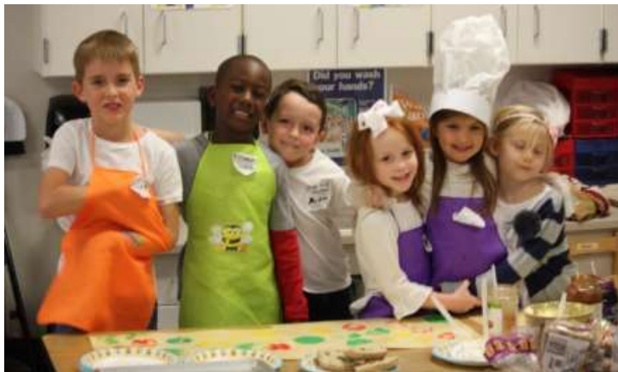
A kindergarten class' "Bagel Café" raised money for a Lego set.