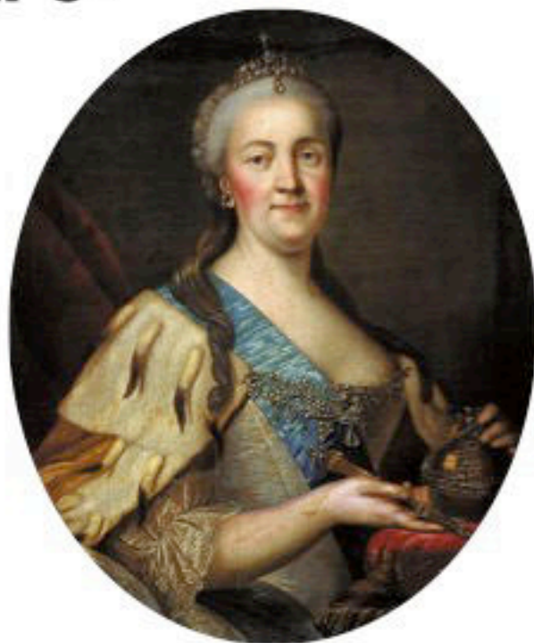
Catherine the Great ruled 1762-1796.