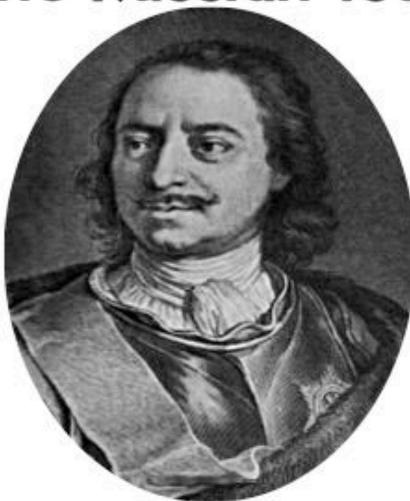
Peter the Great ruled 1696-1725.