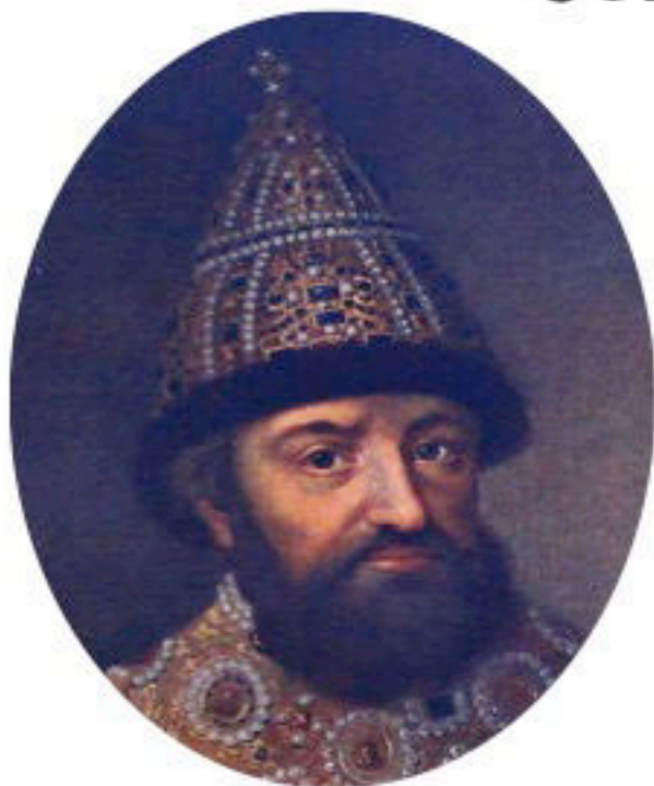
Mikhail Romanov ruled 1613-1645 as the first Romanov tsar.