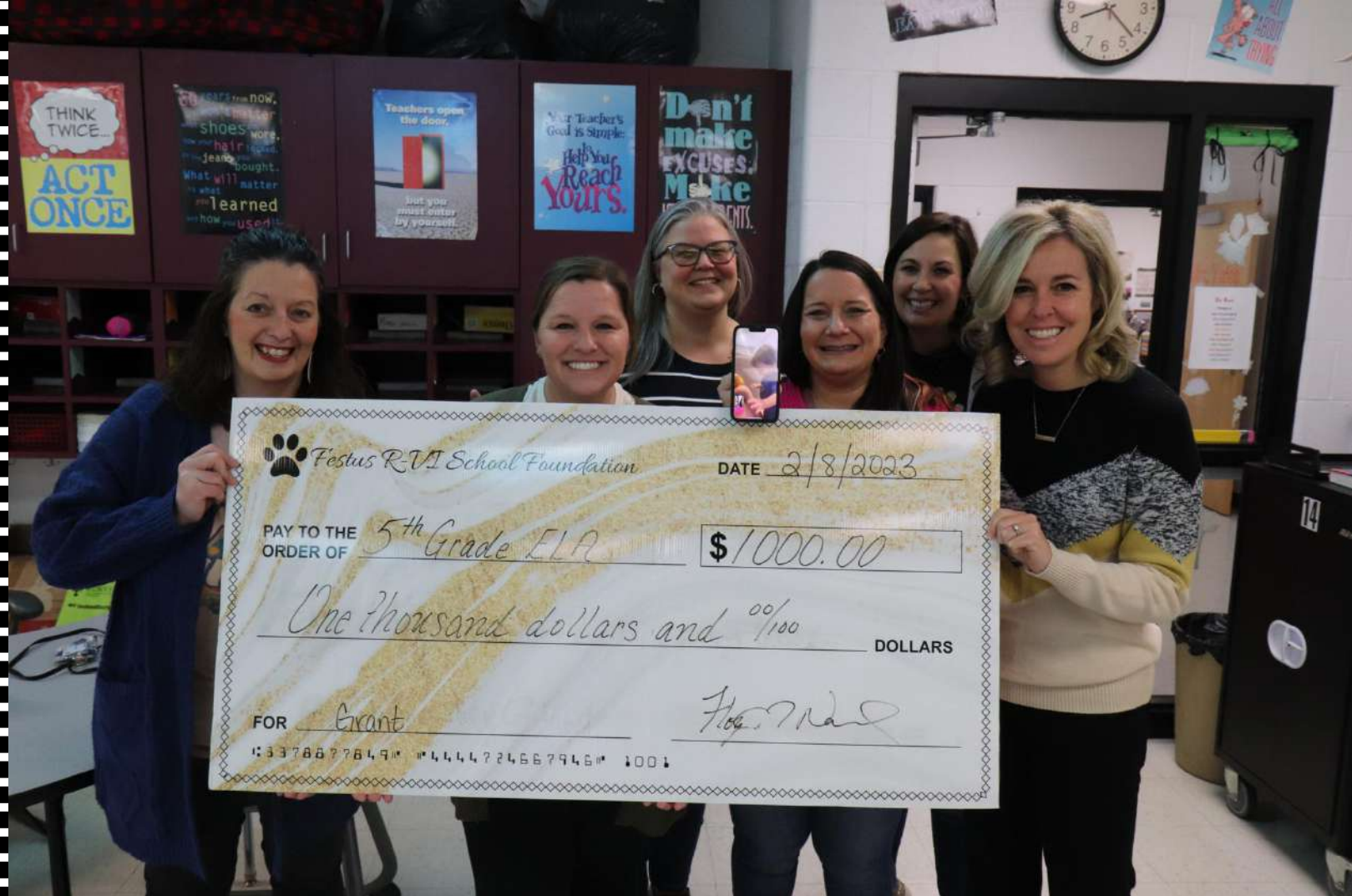
The 5th grade ELA teachers received one thousand dollars to purchase five sets of 30 novels for their literature circle.