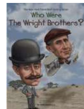
"Who were the Wright Brothers?"

Assignment 2: On a separate sheet of paper, list the title and author of your book. Select and record two character traits that describe the main character or one of the main characters. Provide text evidence to support each trait.