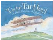
"Amazing North Carolina" OR "T is for Tarheel"