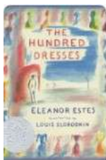
"The Hundred Dresses" By Elanor Estes

Assignment 2: On a separate sheet of paper, list the title and author of your book. Select and record two character traits that describe the main character or one of the main characters. Provide text evidence to support each trait.