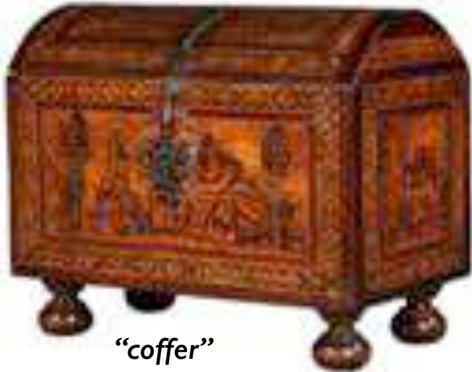
“coffer” a strongbox or small chest for holding valuables