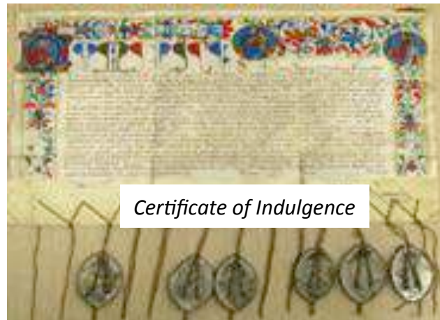
Certificate of Indulgence

In the Catholic Church, an indulgence is a way to reduce the amount of punishment one has to undergo for sins. It may reduce either the penance required after a sin has been forgiven and/or the temporal punishment after death.