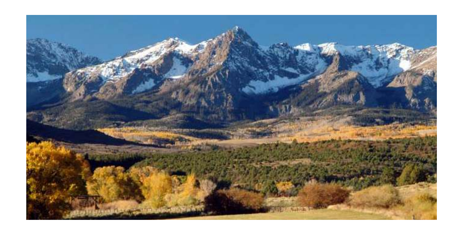
I love the high mountains.