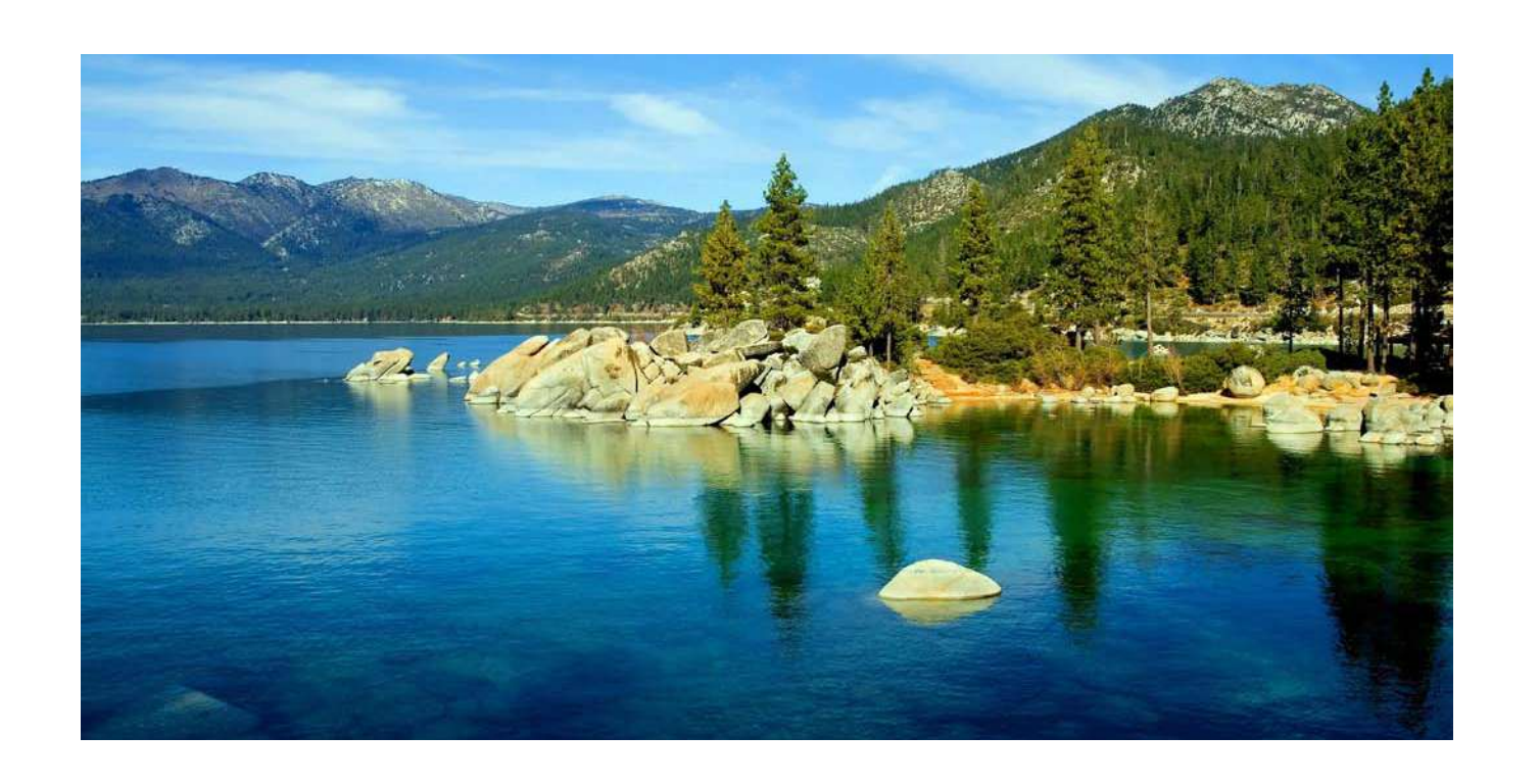
I love the deep lakes.