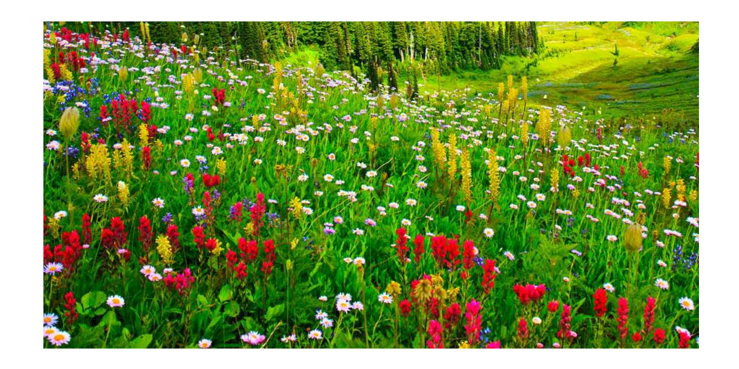
I love the bright flowers.