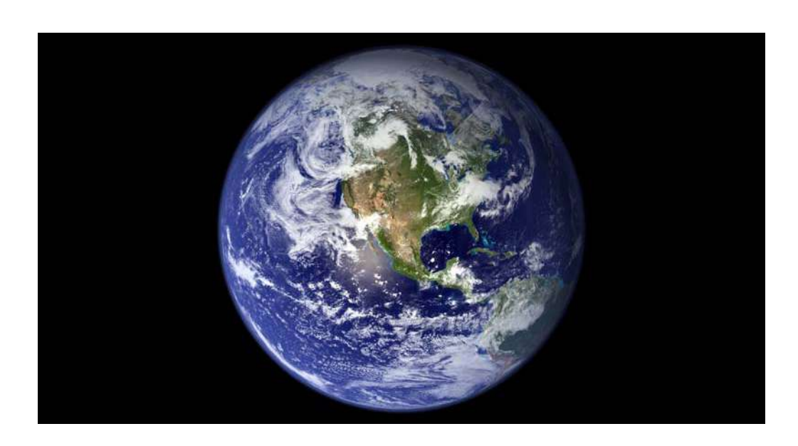
Written by Beverly Osborn