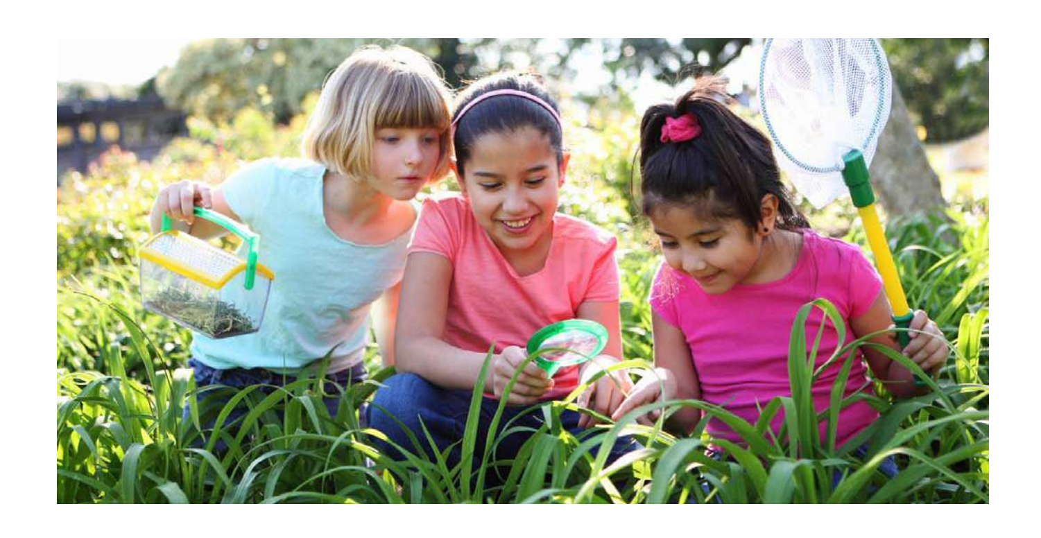
I love the Earth.