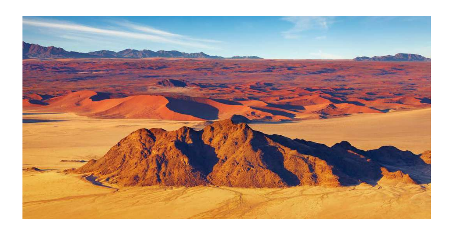
I love the dry deserts.