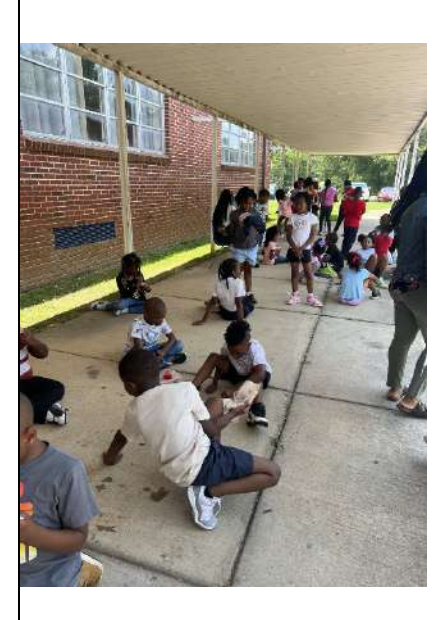
Our A3 Summer Camp students are enjoying the delicious snow cones that were prepared by our counselor.