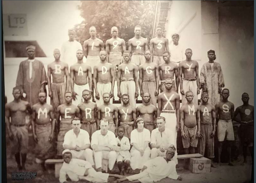
The full caption reads: 'Christmas photograph of staff at the African Oil Nuts Company and Miller Brothers. Three rows of bare-chested African workers pose for the camera, each man's chest painted with a letter spell out '1923, Badagry, Merry Xmas'. Four Europeans dressed in white sit on a makeshift bench up front beside three African children, possibly domestic servants. Badagry, Nigeria, circa 1923 Badagry, Lagos, Nigeria, Western Africa, Africa'.

https://www.nytimes.com/2019/02/06/magazine/when-the-camera-was-a-weapon-of-imperialism-and-when-it-still-is.html