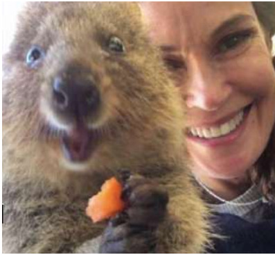
Famous American Actress Terri Hatcher with a Quokka on Rottnest Island

The Quokka Selfie is the latest trend in Australia right now. The best place to see this small marsupial is on Rottnest Island. (the locals call the island Rotto). The Rottnest Island Tourism Board has benefited from this trend and has a few promotional clips with the purpose of increasing tourism to the island.