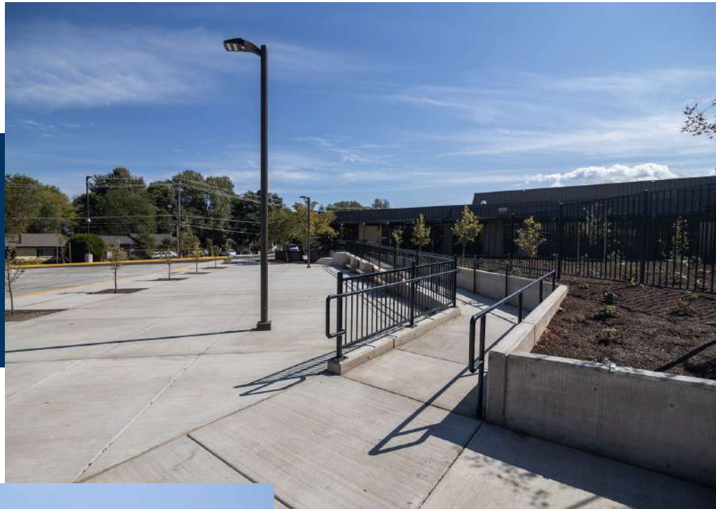
RENOVATED FRONT ENTRY