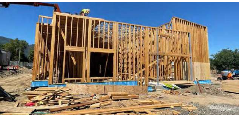
EXTERIOR ELEVATION VIEWS OF ADDITION DEPICTING COMPLETION OF FRAMING/SHEATHING AND FOUNDATION INSULATION

Finish paint and installation of casework are showing signs of completion in the renovated areas. Installation of sheetrock in the cafeteria and kitchen areas provides definition of these areas and the final magnitude of the rooms.