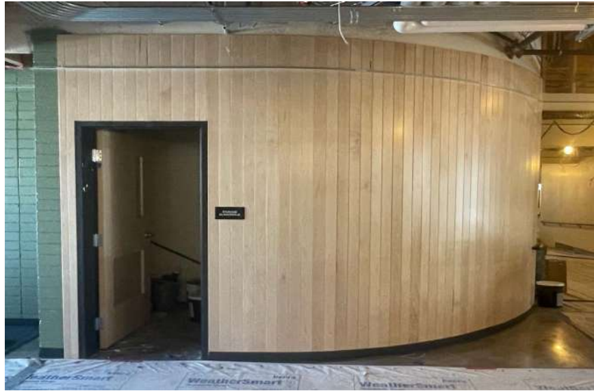
Tongue and Groove Wall Covering at the Admin Area of TRAILS