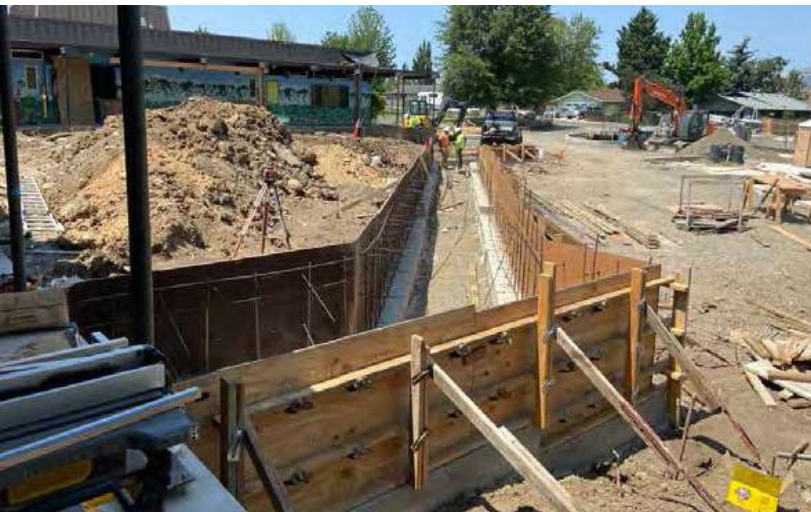
FRONT ENTRY WAY ADA RAMP BEING FORMED