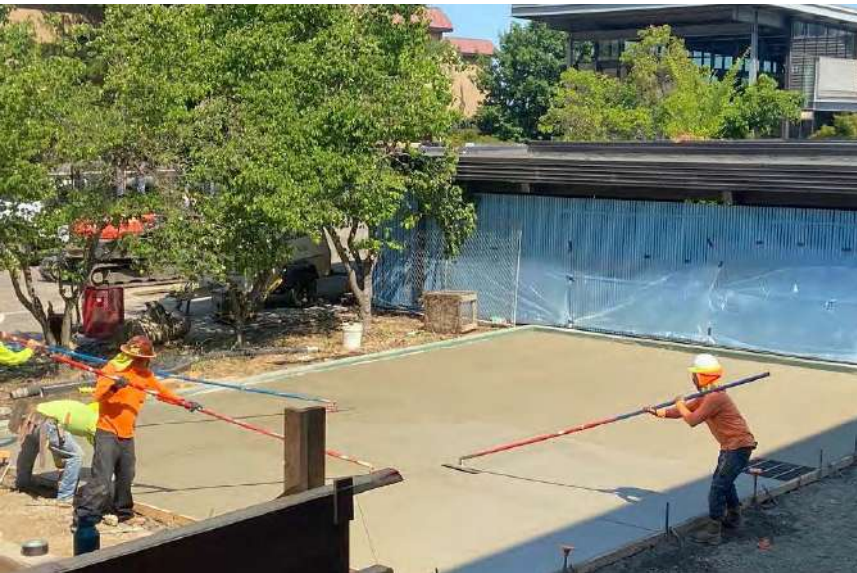
SUNKEN PLAZA FILLED IN AND GETTING CONCRETE FINISHED