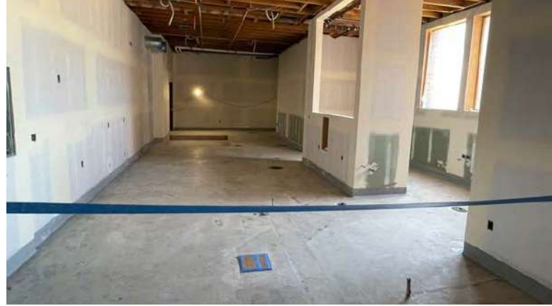
COMPLETION OF SHEETROCK INSTALLATION AT CAFETERIA AND KITCHEN AREAS

Service yard footings were poured, outlining some of the block wall locations directly opposing the new addition and adjacent to the playground. This work, coupled with sheathing of Sector A walls, brought definition to the grand size of the courtyard. Window openings were framed in allowing for final dimensions to be relayed to the window manufacturer, which was an exciting step in the process of getting a watertight building well before fall weather. Delivery of the air handler units was on the shortterm schedule which will allow for completion of the basement and entry way at the North end of the building. Interior paint was being applied in some of the more completed areas alongside ceiling installation/painting. HVAC systems are on site and being installed in corridors and classrooms.