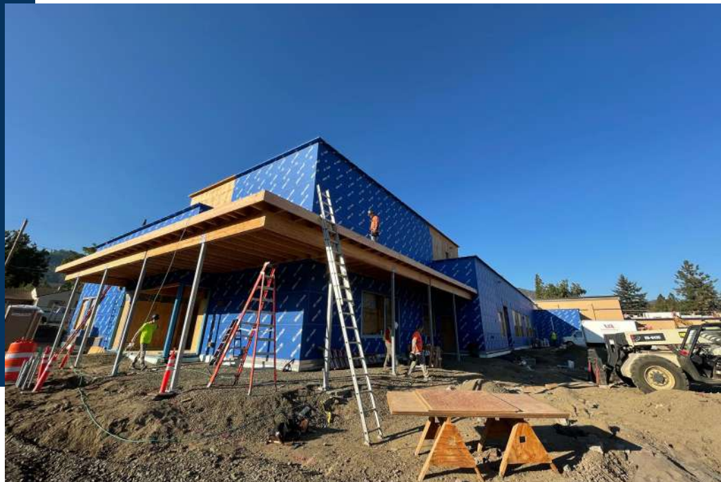
THE NEW MAIN ENTRANCE IS FULLY DEFINED, HINTING AT THE FINAL APPEARANCE