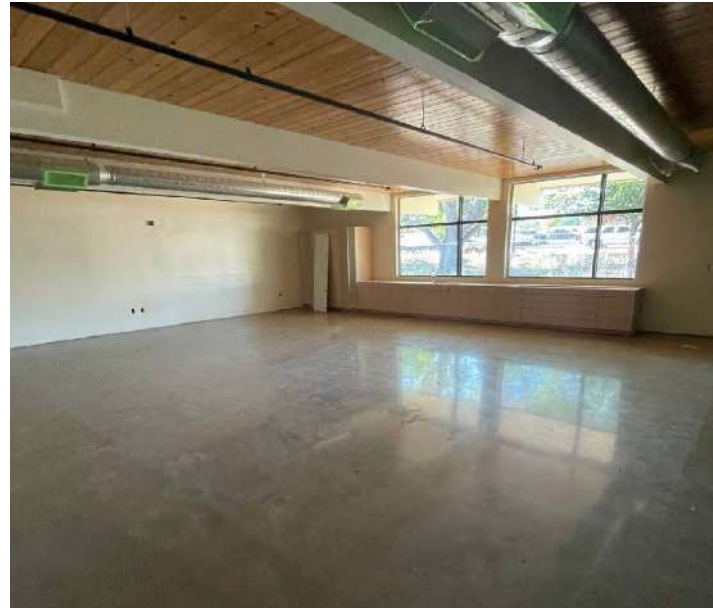
POLISHED CONCRETE FLOORS AND CASEWORK