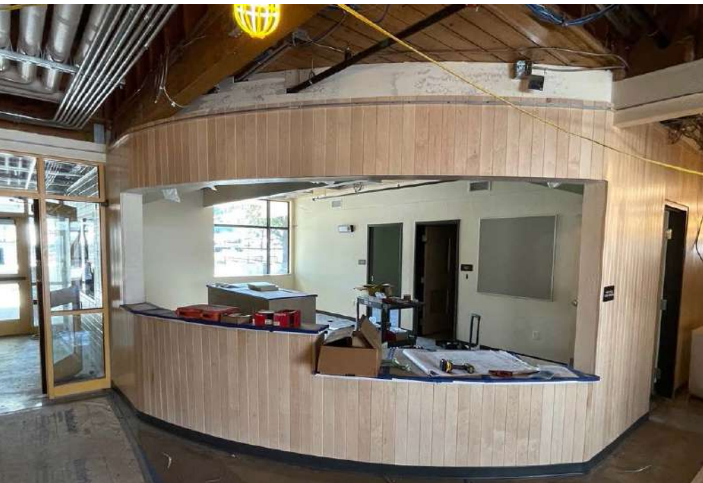
TRAILS NEW FRONT ENTRY AND ADMINISTRATION AREA

August focused on getting things buttoned up so that staff and students could get back into the schools. The High School ADA Commons upgrade was completed, Ashland Middle School finished up and Helman Elementary wrapped up just in time for students to return. At Walker Elementary, finishes are being installed in the renovation area and rough in continues at the new addition. Furthermore, the Walker Gym Seismic project is close to being contracted for work to begin this fall.