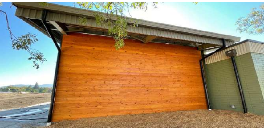
Completed TRAILS Climbing Wall Ready for Install of Climbing Components