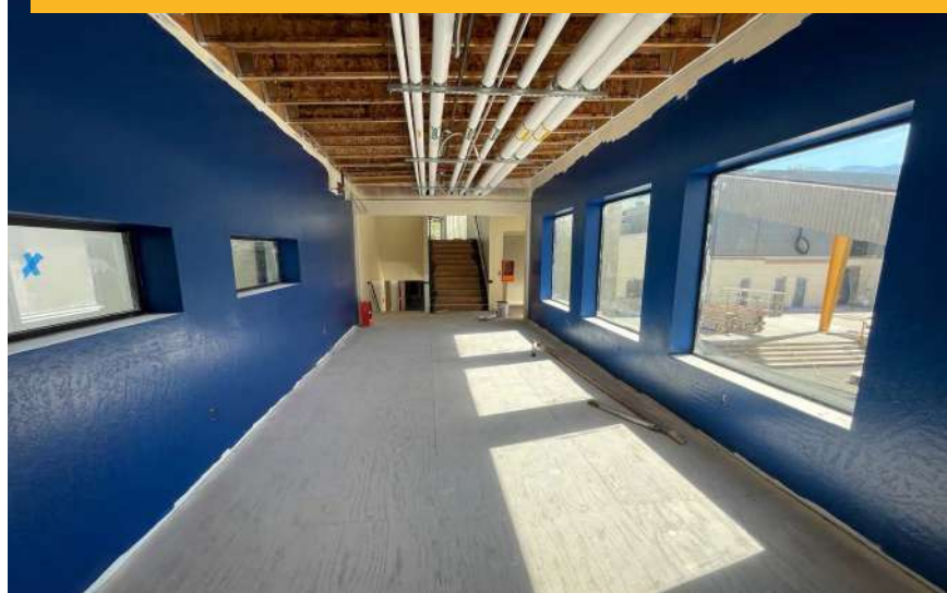
ASHLAND MIDDLE SCHOOL SKYBRIDGE INTERIOR FINISH PROGRESS

July marked one of the busiest months to date for the bond projects. AMS was on the last push for completion with TRAILS close behind. The High School ADA Commons upgrade was well underway with the much needed ADA upgrades starting to take shape. Helman Elementary was also on the last push for completion with most of the work focused at the front of the school in the Administration area and Quad C. Walker Elementary continued in construction and was moving along on schedule.