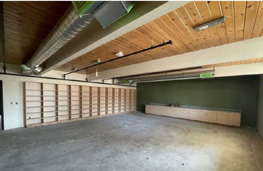
INSTALLED CASEWORK AND FINISH PLUMBING