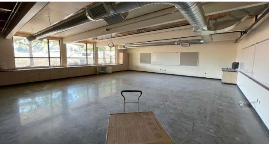
TRAILS Classroom in Final Stages of Completion