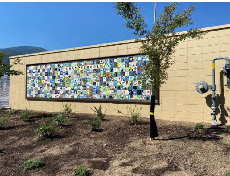
RELOCATED/SALVAGED MURAL INSTALLED