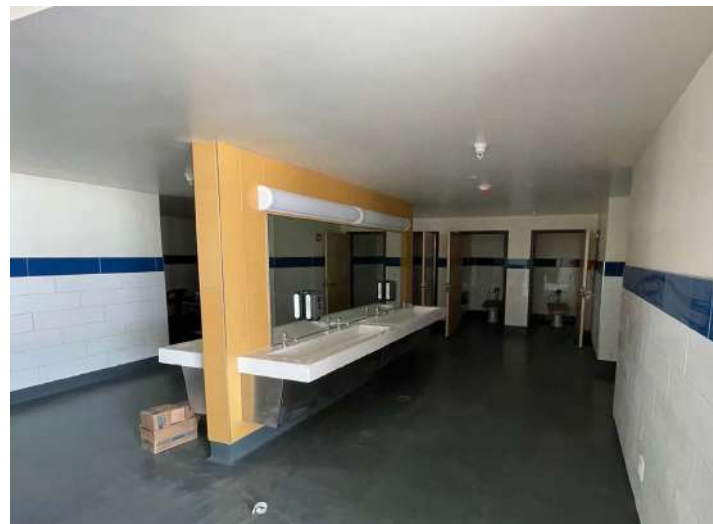
BUILDING C BATHROOM NEARLY COMPLETE