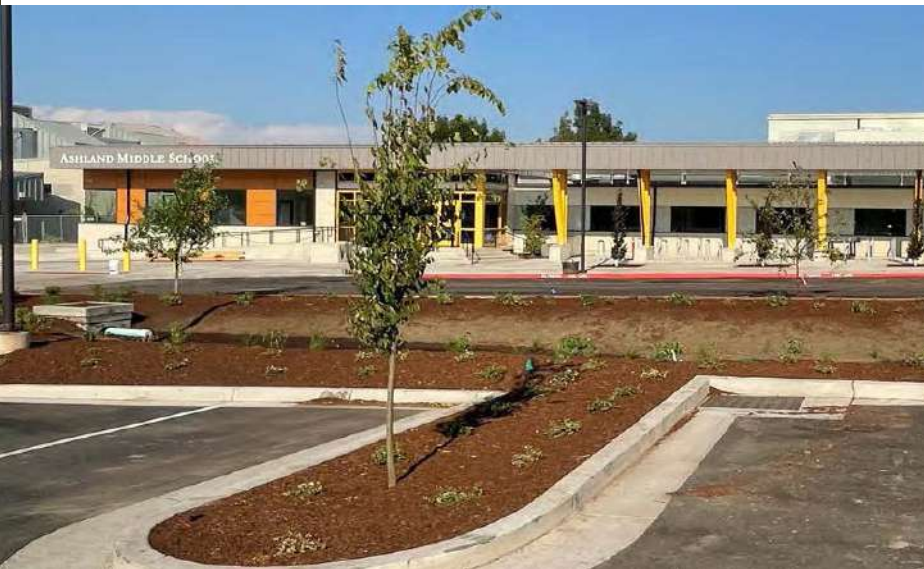
ASHLAND MIDDLE SCHOOL FRONT ENTRANCE