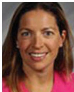
Wisconsin