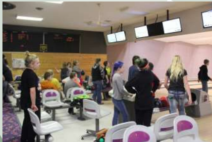
Elementary students enjoying their Christmas party!

In addition to the above, there are some standardized tests done in the elementary throughout the year and there are tests given every day in one content or another. They are used to assess our teaching and in the case of the ACT to judge our kids. Sometimes it seems like time might be better spent in a classroom, but tests do help teachers make classroom time more productive.