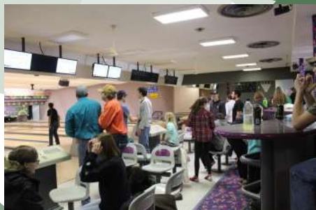
High School having fun at Christmas bowling party!