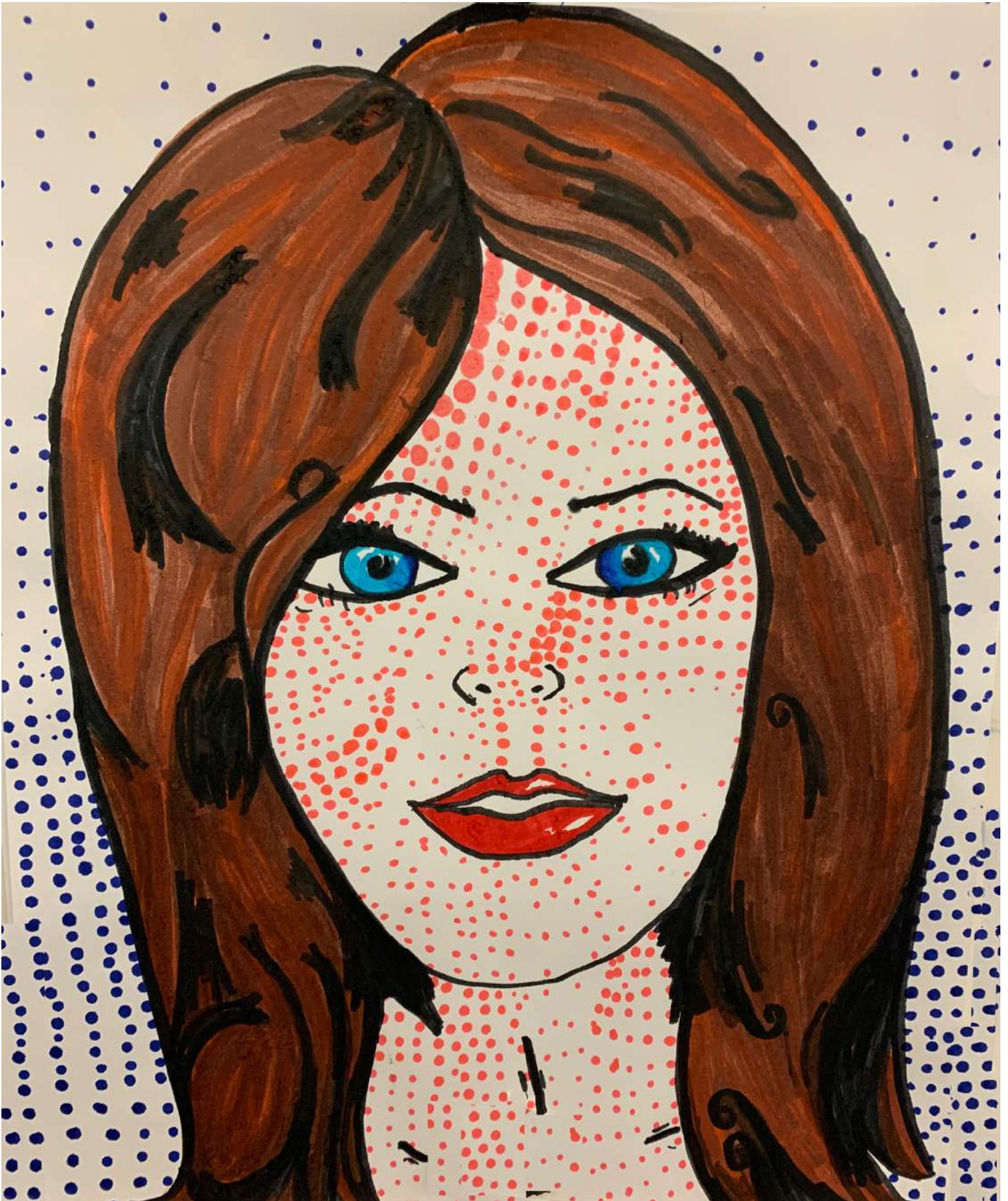
Ben-Dots with Markers