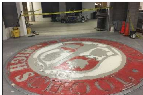
A school seal will greet students in the new commons area.

The $20 million renovation project at Center Grove High School is in its final phases, with renovation underway on the new commons area in the center of the building's main floor. The project started last fall is expected to be complete by the end of the year.