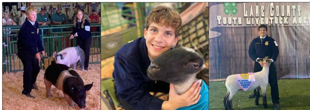
Middle and high school students showing market animals at the 2023 Lane County Fair

Our Chapter is excited about welcoming many new Middle and High School students. Our first meeting will be held at the HS Student Center Monday, September 25 at 6:30 pm. Our Ag program and FFA Chapter started events and activities for middle and high school students the first week of school! We have planned over 20 career development events, multiple field trips and guest speakers, community service projects, and amazing class activities in our district workshops and labs! Thank you to the community and parents for supporting such an active and productive program.