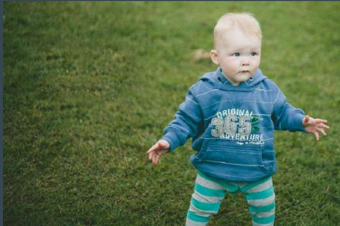
eyespace cut off, giving a sense of unease

Show the area your subject is looking into.