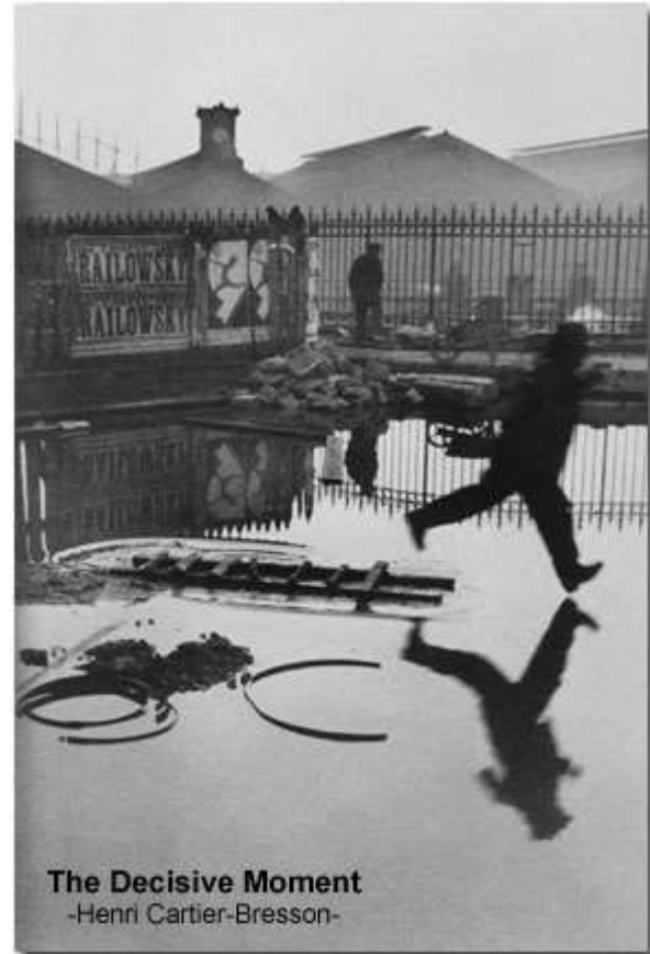
The Decisive Moment -Henri Cartier-Bresson-