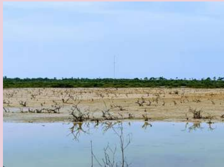
#9 Play with angles.