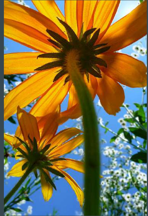
Worm's eye view