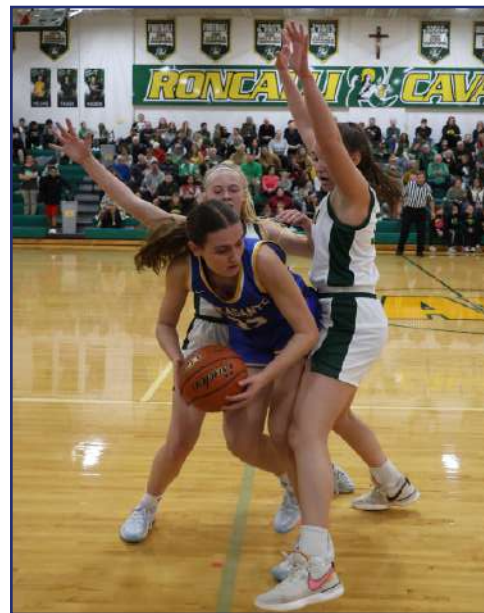
Trapped at the Half.

The Pheasants traveled to Clark on Jan. 25, and fell to the Cyclones, 37-50.