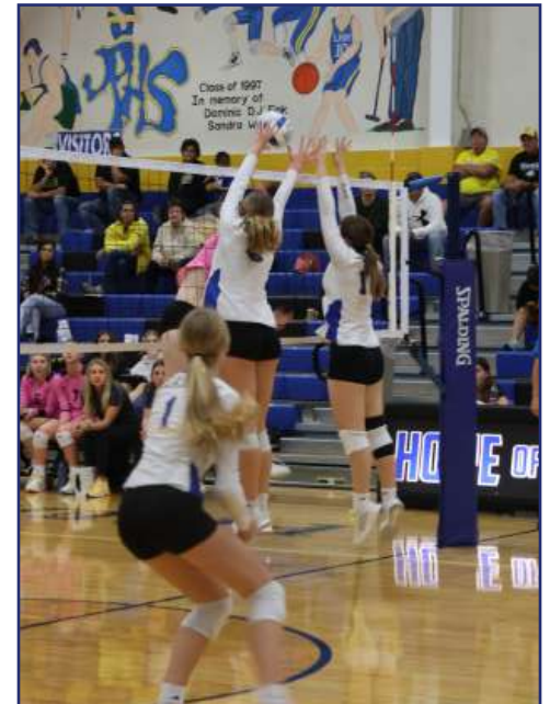
Block and Watch.

"I'm sad that the volleyball season is over. I enjoyed getting to play with my teammates and seeing how we improved throughout