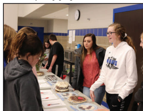
Students look through the items that were donated for the silent auction during the CTE event that was held during the girls' basketball game on Feb. 13.

I think that CTE programs are very important in schools because they help prepare students for the future.