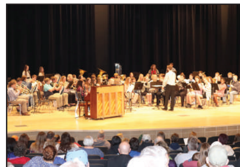
Back on Stage.

fore, the balance of sound is very equal among the different instruments and the students appear to be very excited to play in the new facility. They were excited to play in the new auditorium and perform their contest music."