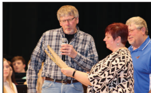
Opening the Time Capsule.