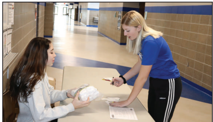
Donating During the Holidays.

There will be two winners at the end of the week in both high school and middle school.