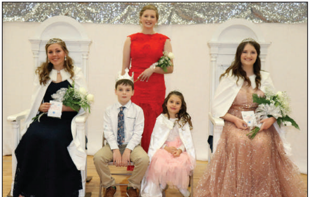
Snow Queen Court.