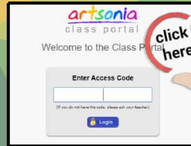
Artsonia Classroom Portal