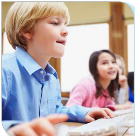
PARCC assessments provide students with accessibility tools they frequently use in classrooms and daily life.

“National PTA supports PARCC in its efforts to allow every single child the opportunity to show what he or she knows, and to allow parents and teachers of these children access to the quality information they need to make decisions about improving learning outcomes.”