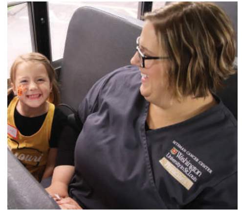
Incoming students got the chance to see what the school bus is all about.