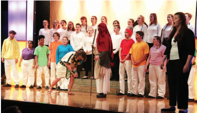
A scene from "Joseph & the Amazing Technicolor Dreamcoat".

The Festus High School Theater Department received two nominations for St. Louis High School Musical Awards for its spring production of "Joseph and the Amazing Technicolor Dreamcoat." The department received a nomination for Outstanding Ensemble and a nomination for Outstanding Musical – Budget Level 2. Awards were announced at the Fox Theatre on Sunday, June 2 (after the A Step Ahead deadline). The department also produced another play this spring, Neil Simon's "The Good Doctor."