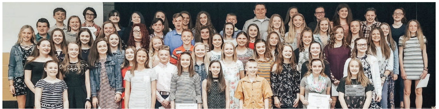
The 59 new members welcomed into the Festus Middle School National Junior Honor Society.