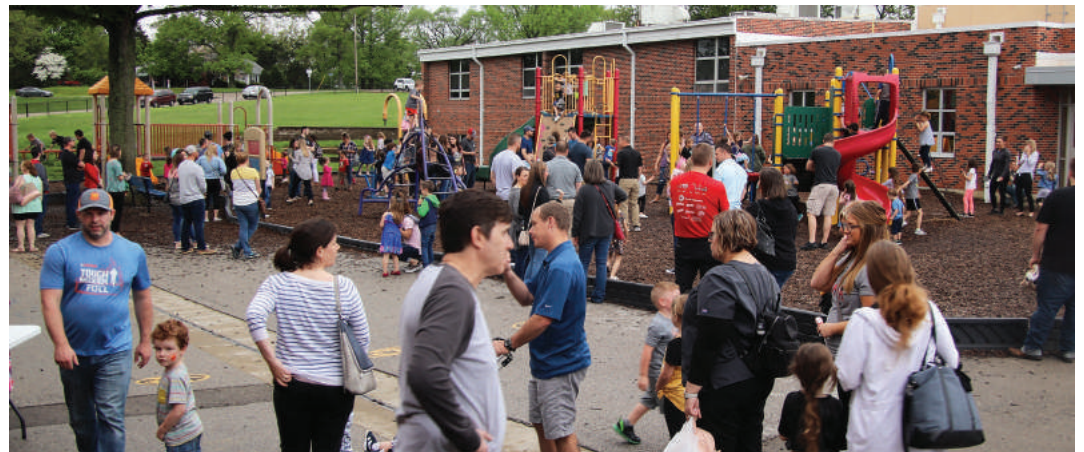
Incoming students got a chance to try out the playground equipment they will use next school year.