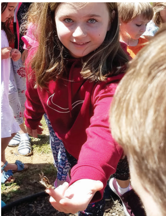
Students in Mrs. Norrick's 2nd grade class gather around to see the baby chicks.

Our third grade classrooms began their discussion by placing Painted Lady caterpillar larvae in small plastic cups with food until they formed their chrysalis. Then all of the chrysalises were moved inside a mesh netting until they emerged as adult butterflies. Along the way, teachers and students talked about what was happening. Once all of the butterflies emerged, they were released into the wild.