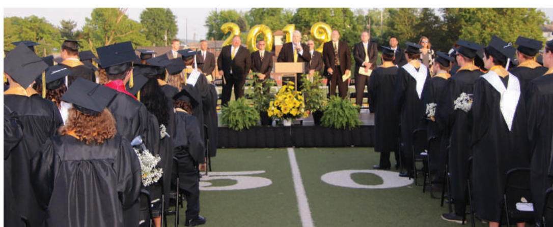
199 students graduated from Festus High School on Wednesday, May 22. For more on graduation and this year's senior awards see pages 8 & 9