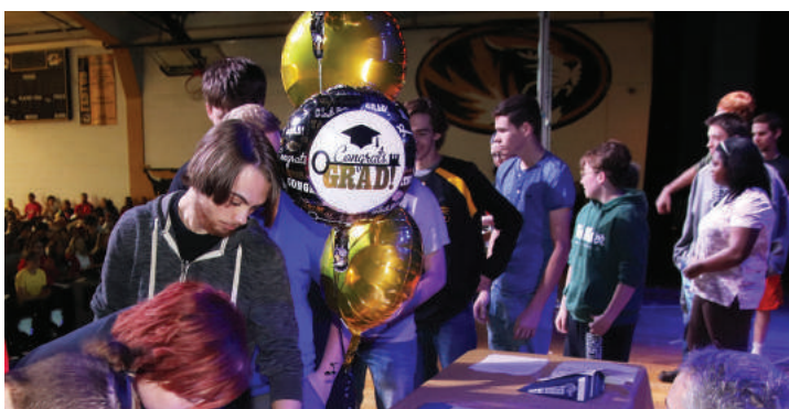
High School seniors sign a banner declaring their next step in life.