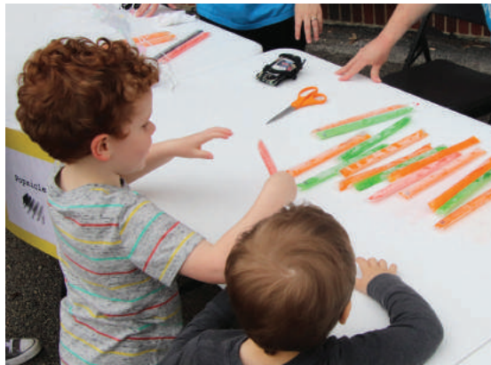
Incoming students enjoyed a popsicle while playing outside.

The Elementary School hosted a "Kindergarten Kickoff" at Festus Elementary School for children who are entering Kindergarten in the 2019-2020 school year. Children got to meet the kindergarten teachers along with the Reading Power, art, and music teachers. Information about summer school was available, and Parents as Teachers provided information about their organization and ran a fun activity. The Parent Teacher Organization had Festus Spirit Wear for sale, too. Other activities included making bracelets, playing a literacy game, face painting, making maracas, taking a tour of a school bus, and playing on the playground. Every incoming kindergarten student received a free popsicle for attending!