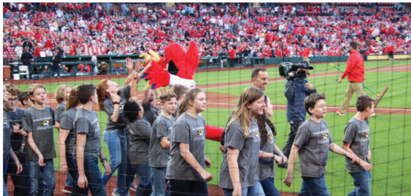
Honor Choir members high-five Fredbird as they leave the field at Busch Stadium after performing the National Anthem on April 26.