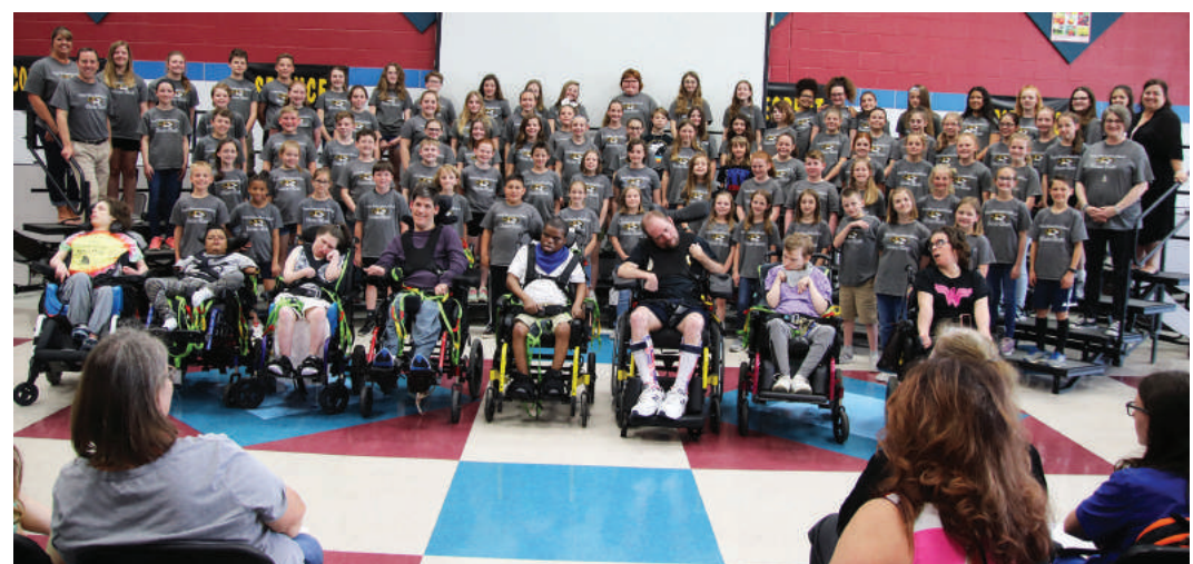
The Honor Choir poses with residents of Pony Bird.