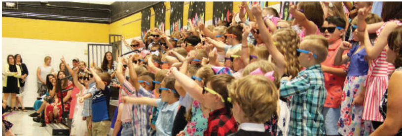
Kindergarten students sing their graduation song "We Are First Graders" to the tune of "We Are The Champions."

More than 250 Kindergarten students "graduated" to 1st grade on the last day of school. Our annual Kindergarten promotion ceremonies featured a song by the students and the reading of each student's name as they walked across the stage to receive their Kindergarten certificate.