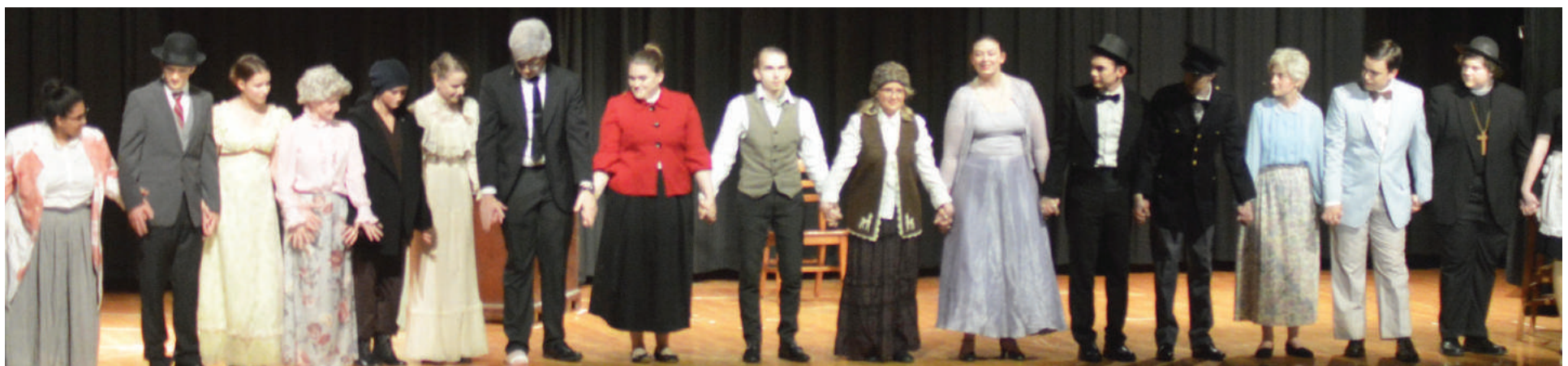
The Good Doctor – The cast of Neil Simon's "The Good Doctor".