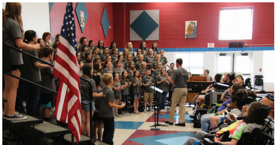
The Honor Choir performs for residents of Pony Bird.