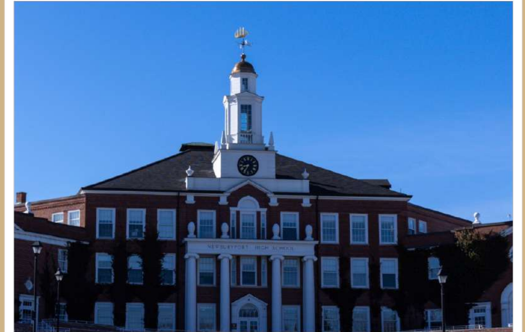
Newburyport High School