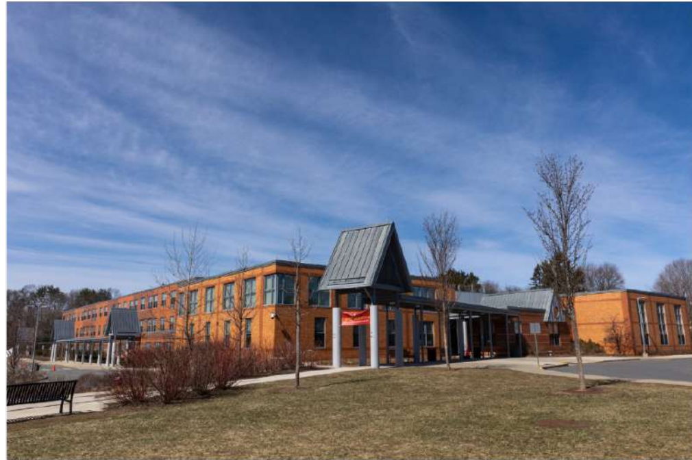
Francis T. Bresnahan Elementary