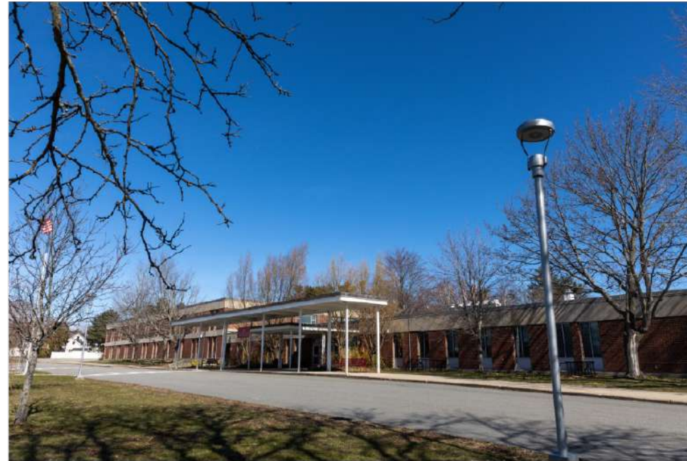
Edward G. Molin Upper Elementary Rupert A. Nock Middle