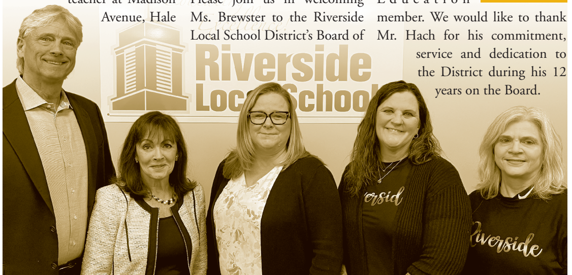
— 2024 RLSD Board of Education Members —