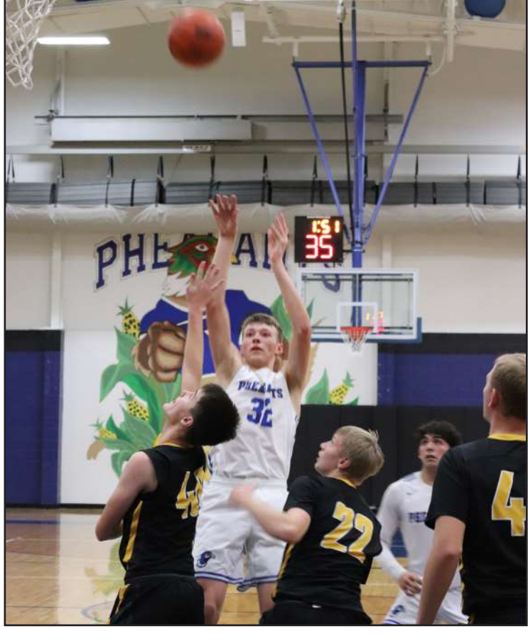
Up for Two.

On Dec. 22 the Redfield varsiy basketball team lost their home game against Groton, 61-59, and on Dec. 18, the team won their away game against Roncalli, 59-58.