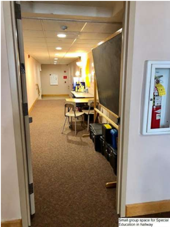
Small group space for Special Education in hallway