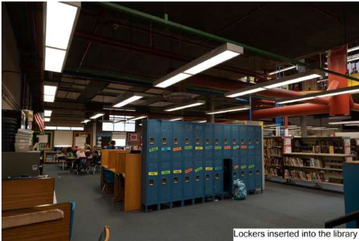
Lockers inserted into the library