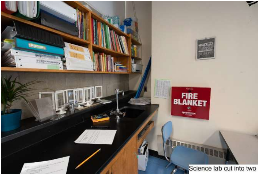
Science lab cut into two