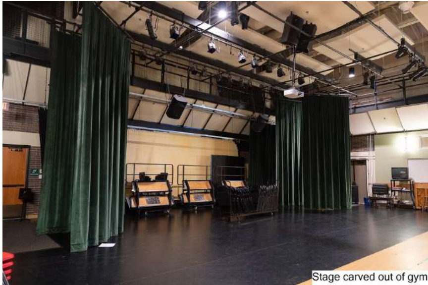
Stage carved out of gym