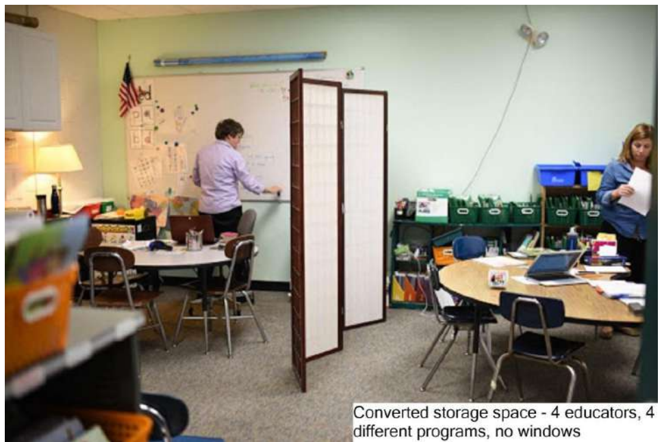
Converted storage space - 4 educators, 4 different programs, no windows