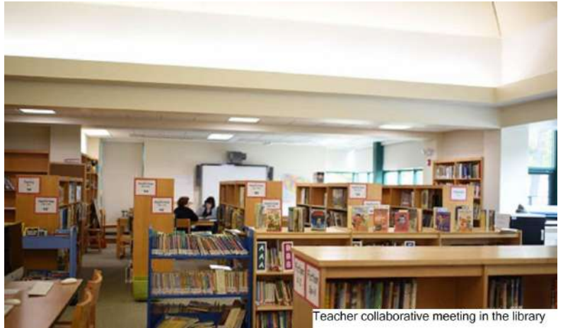
Teacher collaborative meeting in the library