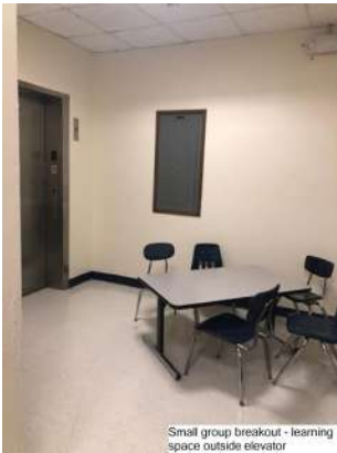
Small group breakout - learning space outside elevator