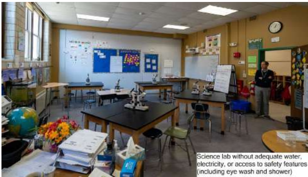
Science lab without adequate water, electricity, or access to safety features (including eye wash and shower)