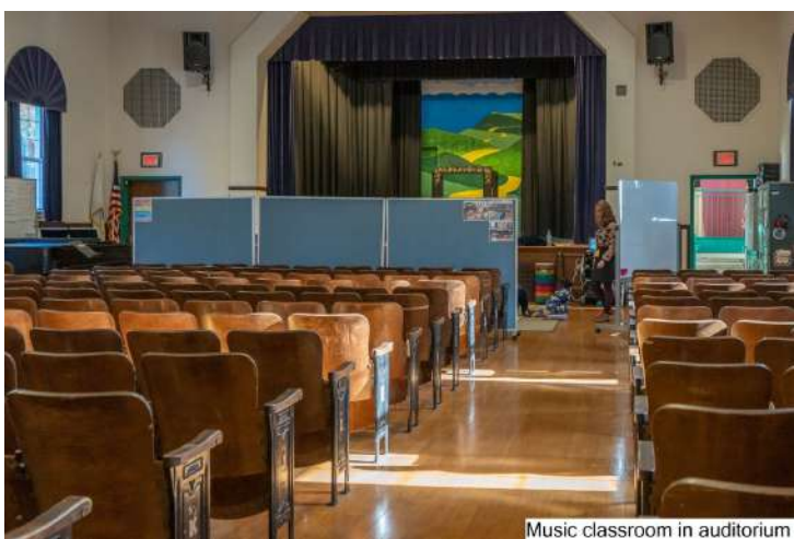
Music classroom in auditorium