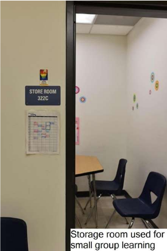
Storage room used for small group learning