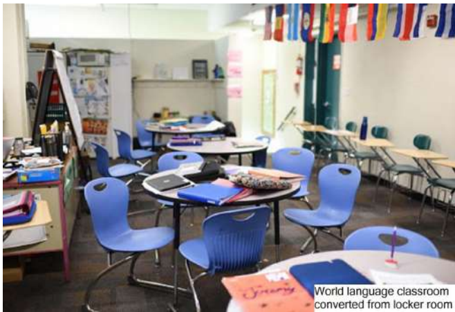
World language classroom converted from locker room