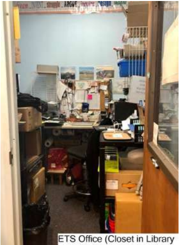
ETS Office (Closet in Library)