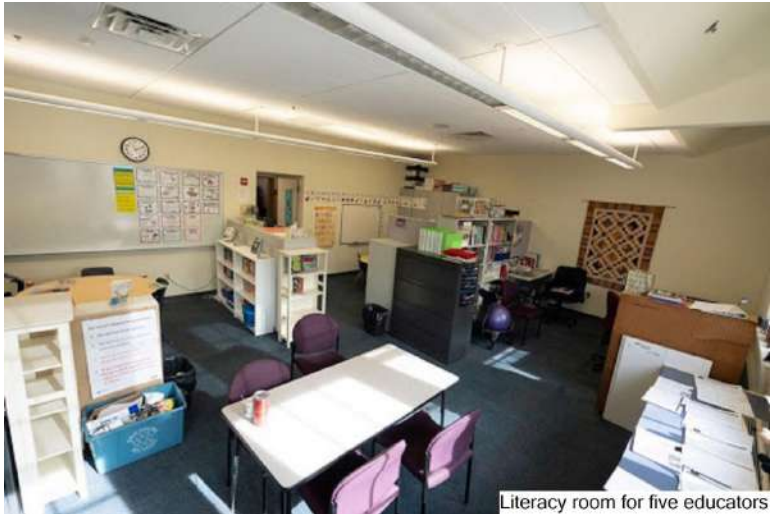
Literacy room for five educators