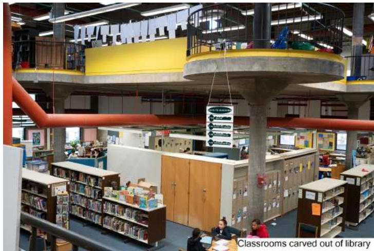
Classrooms carved out of library