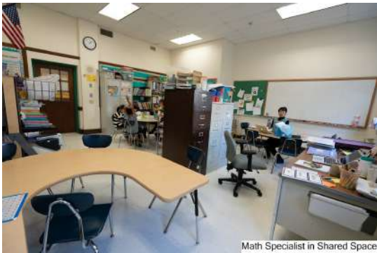
Math Specialist in Shared Space