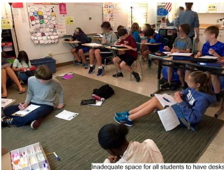
Inadequate space for all students to have desks