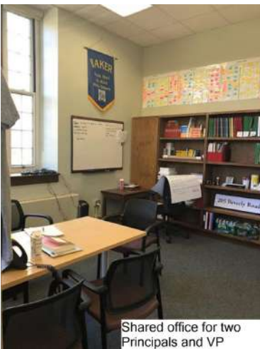
Shared office for two Principals and VP