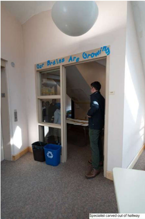
Specialist carved out of hallway