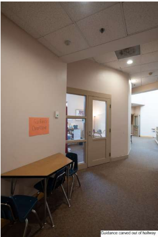
Guidance carved out of hallway