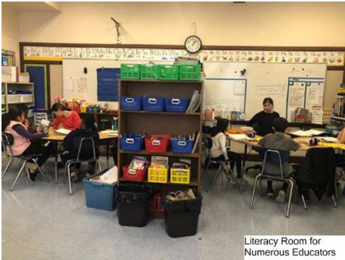
Literacy Room for Numerous Educators