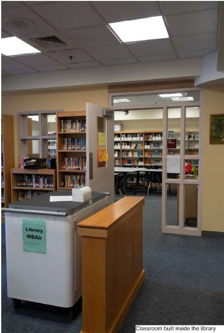
Classroom built inside the library