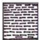
repeating broken lines