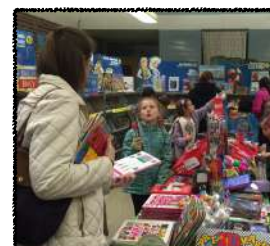
Fundraising Success at the Book Fair!