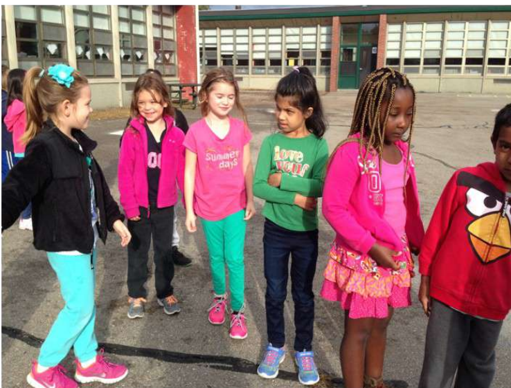
First graders line up for their first “Walk-at-School Day”.

The students studied Christopher Columbus and learned more about his role in discovering America as a part of our social studies curriculum and they have been working on mapping skills by creating a map of their bedroom.