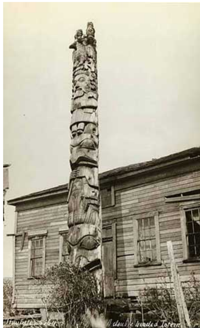
Kingston, B.C. 1910. The double-headed Totem.