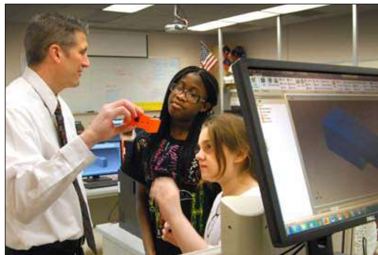
Maple Point MS students examine an object created with the school's 3-D printer, designed using industry-standard Inventor software. Each middle school and the high school operates 3-D printers.

Educating our students to operate in this new environment is the primary goal of a series of new initiatives introduced at all Neshaminy schools this year. These changes, outlined in a recent report (available on the District web site), started with the introduction of new